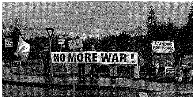
New banner at 4 pm Sunday vigil, 2/11/07, 2 nd and Adams