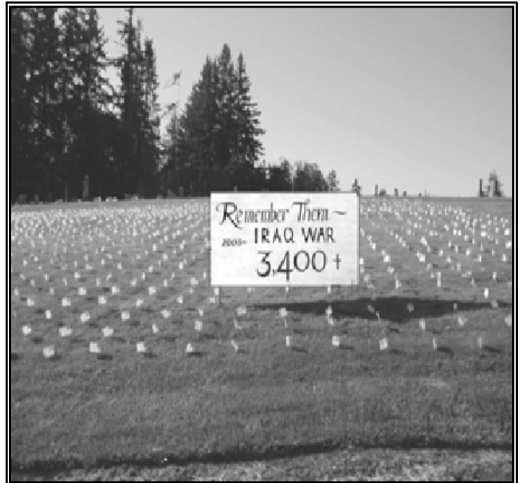
Peacemakers 2007- Now the number is 4000+.